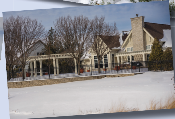
STONEGATE WEST WINTER