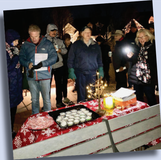
COCOA AND CAROLING