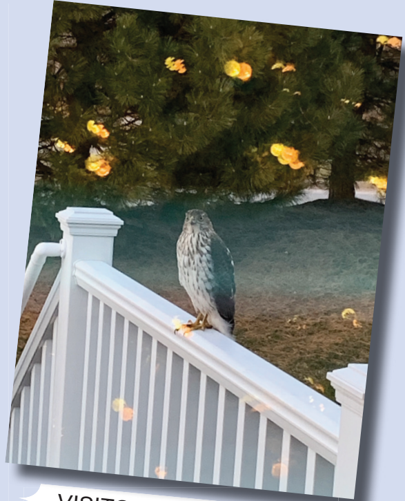
VISITOR IN CUROES' BACKYARD ON COLCHESTER LANE